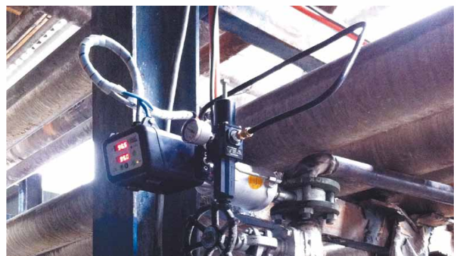
Palm oil producer, Palmaju Edible Oil, saves 5 tons of steam per day by using sliding gate valves

as they slide against each other so that these valves combine long service lives with a high level of enduring leak tightness, even under the severe conditions they face in steam systems, for example. As an option, sliding gate plates are also available in carbon, so that an excellent seal is assured even at very high temperatures with a hard/soft combination of materials. The very short stroke is also a factor in service life: short motion paths and switching times protect the packing and the actuator. In the sliding gate valve, both are subject to substantially lower loads. Even after many years, many sliding gate valves reveal no traces of wear either on the diaphragm or in the packing area. The body length of sliding gate valves is extremely short so that they fit easily between two flanges and are easy to handle - including its actuator a DN 150 weighs no more than 14.2 kg. So it only takes one person for removal, installation and maintenance. Sliding gate valves are available in sizes DN 15 to DN 250 for pressures up to PN 100 and media temperatures from - 100 °C to + 350 °C (max. 530 °C).