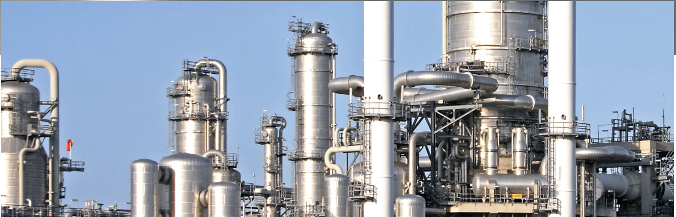
Category: Valves, Pipes

Ticona solves tricky situation with Ball Sector Valve